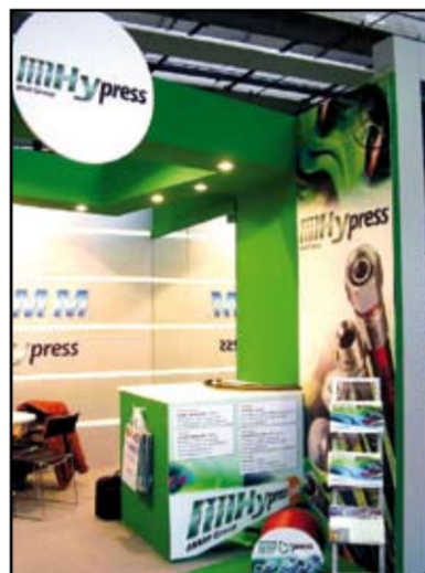
SAMOTER VERONA - MARCH 5-9, 2008

Even this year Hypress takes part to the National Agricultural Exhibition in Lanciano, with a show floor greater than the previous editions to establish itself as a leading company at a local level. Hypress network puts itself as "hydraulic partner", with a widespread supply capacity and a complete range of products. An innovative approach to planning joint efforts with the manufacturers: inside our stand you can find a BSI vehicle with complete hydraulic diagrams designed and achieved by Hypress staff. Another interesting point is a simulation of a Hypress Point preparing.