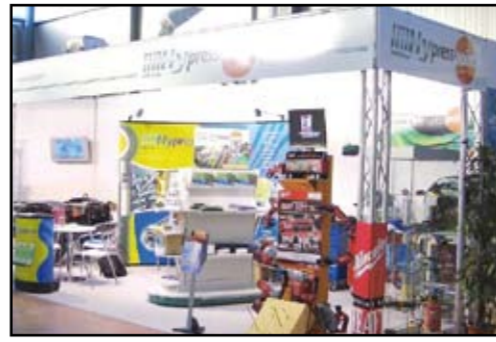
NATIONAL AGRICULTURAL EXHIBITION LANCIANO - APRIL 24-27, 2008

Hypress attends to International Show of Public Works, Constructions and Mining Machinery. Positive contacts with a lot of manufacturers present with its own show floor; Hypress puts across the Spanish market its capability based on assistance, spare parts and design.