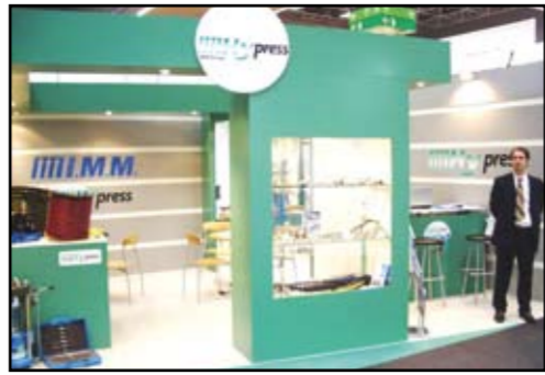
BIEMH BILBAO - MARCH 3-8, 2008

New innovative and impact stand showed visitors a strengthened reality as I.M.M. GROUP, a synergetic integration between productive activity and business distribution with Hypress network, in Italy and abroad. With the presence of all branches and commercial offices leaders (Italy, Great Britain, Germany, France, South Africa), during these four days our stand has received a lot of visitors interested in company development plans in addition to new products and commercial collaboration opportunities with a side dedicated to "Hypress Point" proposal.