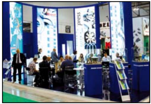
FLUIDTRANS COMPOMAC MILAN - MAY 27-30, 2008

Registering over 60.000 attendees with about 18.000 foreign visitors, Fluidtrans Compomac Biennial Exhibition established itself as a great event for professional operators. Even this year I.M.M. Hydraulics S.p.A. takes part to this traditional and important appointment with the most eagerly awaited international event for Fluid Line Industry.